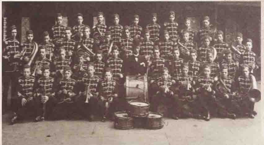
The Boys' Band

Hope Street will be an original, gritty and emotional series reflecting the true hardships of Victorian slum-life and the triumphant victories that emerged from such misery, whilst conveying the lasting power and effects the institution, its benefactors and even its enemies have on society.