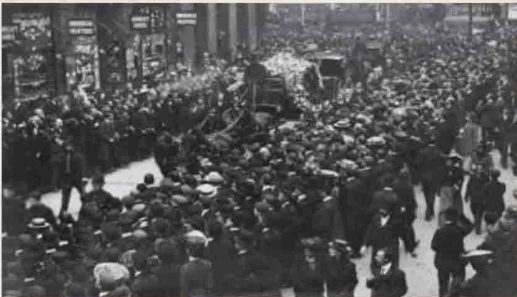
The Funeral of Thomas J. Barnardo